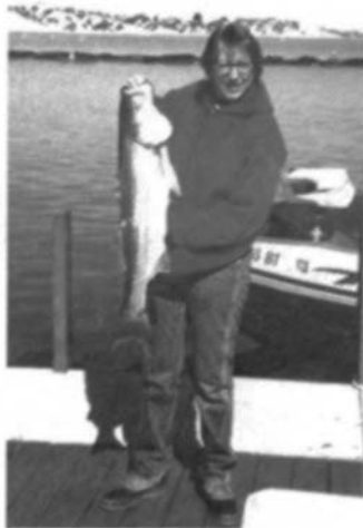
Some pretty big fish!