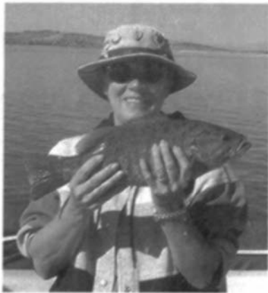
A happy fisherwoman!

A day of fishing or playing on the lake, a walk down a sandy beach, a cookout with friends and family or dinner in a local restaurant. It's all here at Elephant Butte!