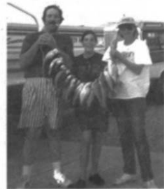
Eatin' good tonight!

The lake is stocked with many species of game fish including: Catfish, white, black and largemouth Bass, Crappie and record setting Stripers. Catch them on your own or with the help of a local guide!