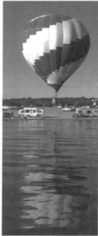
Enjoy the peaceful atmosphere of Elephant Butte Lake State Park!

A day of fishing or playing on the lake, a walk down a sandy beach, a cookout with friends and family or dinner in a local restaurant. It's all here at Elephant Butte!