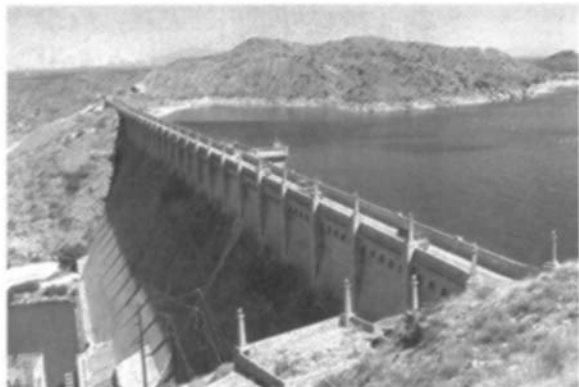
Elephant Butte Dam

The dam was constructed primarily for irrigation purposes. The reservoir heads a large system of dams, rivers and irrigation canals that extend 200 miles down the Rio Grande Valley to El Paso, Texas. The lake has a surface area of 38,000 acres at spillway level.