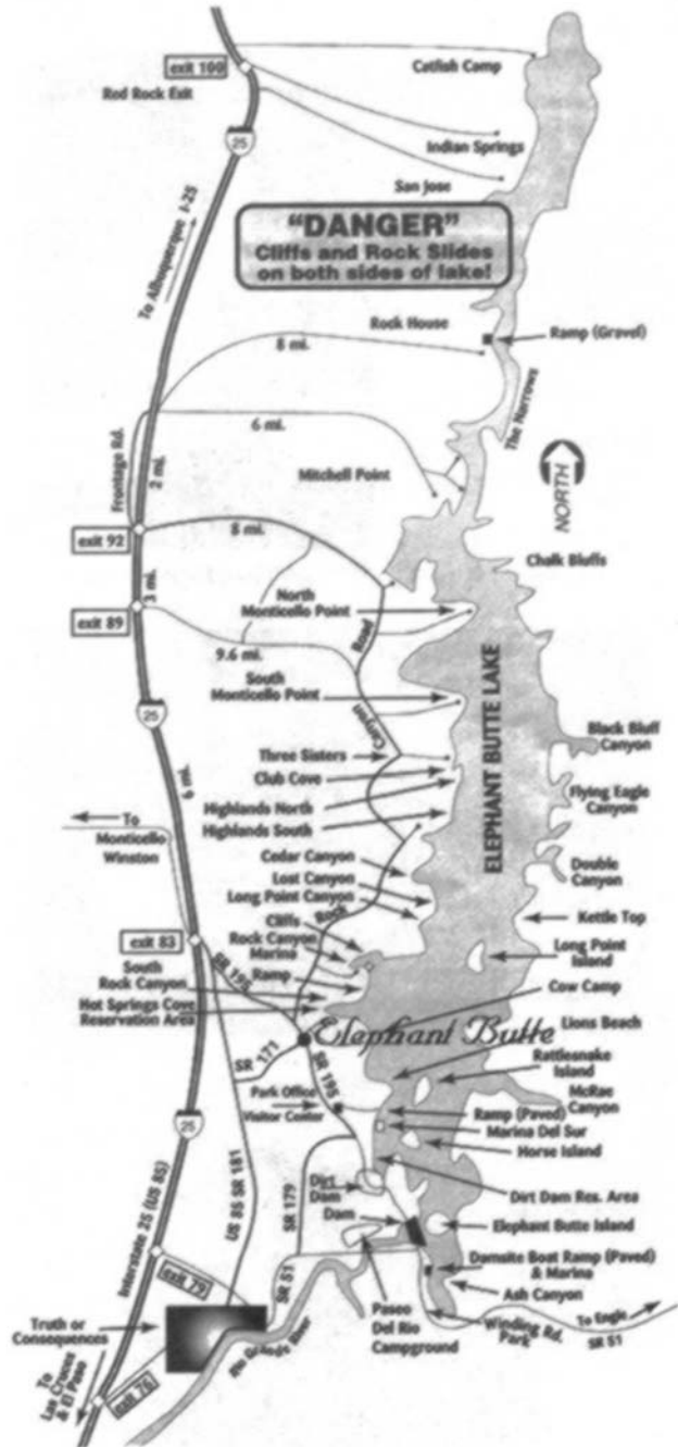
Map from the Elephant Butte Lake State Park flyer