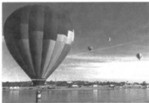
The Elephant Butte Balloon Regatta

The dam was built by the U.S. Bureau of Reclamation. Construction of the dam began in 1912 and was completed in 1916. It is 306 feet high and 1674 feet long, with a reservoir capacity of 2.2 million acre feet. In the late 1930s the power generating station was added to harness the energy of the Rio Grande. The hydroelectric plant can produce about 24,000 kilowatts of electricity.