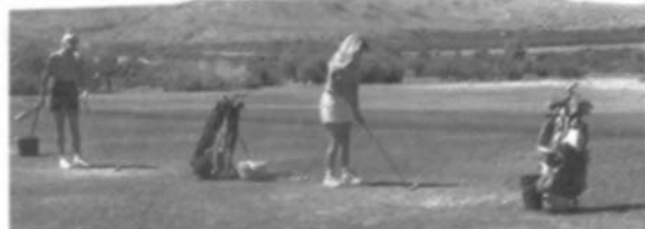
Golfing at Elephant Butte

The Elephant Butte Lake State park hosts close to 1.7 million visitors annually, with Memorial Day, Fourth of July and Labor Day drawing 80 - 100 thousand visitors per weekend. Camping and RV facilities are available, some with water and electric hook-ups. However, pitching a tent right on the beach is most popular!